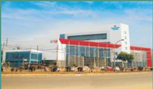
Actual Site Picture

Time Tower- Functional Business Unit on M.G. Road, Gurgaon.