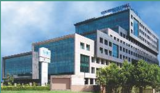
Actual Site Picture

Keeping in sync with its tradition of bringing brilliantly executed designs and construction, for many years Suncity has been delighting your senses with perfectly accented styling in all its buildings. The most recent examples of these can be seen in two of their meticulously planned business units- TIME TOWER & SUNCITY BUSINESS TOWER.